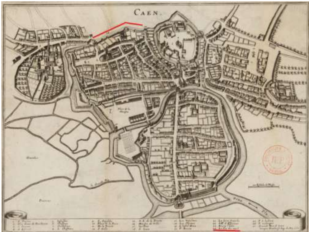
On a map from the 17 th century, a jeu de mail existed in the north of the city near th Caen Castle.