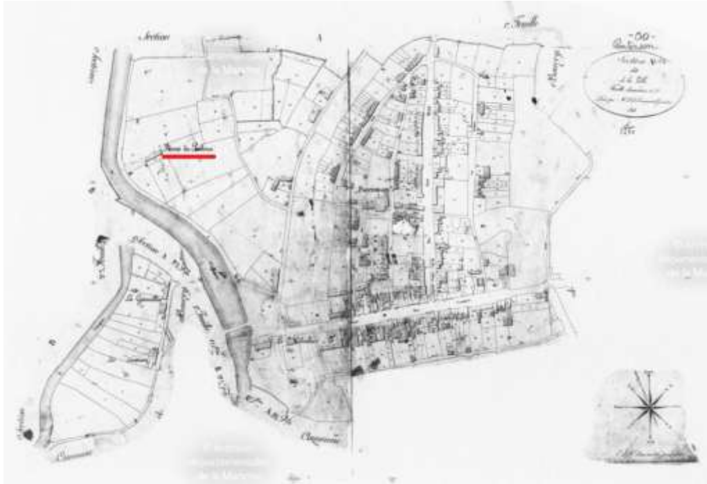
The 'Ferme (farm) de Pailma' was outside the city, as is today the hamlet of Pailma.