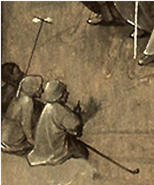
Museu Nacional de Arte Antiga, Lisboa (Lisbon)

Also the rears of the side panels are decorated with presentations. These rear presentations are done often in grisaille, different (fifty 😊) shades of grey. On the rear of the right side panel Christ is depicted carrying the cross. At the extreme left of the panel three boys are visible. One of them is holding a golf club.