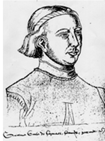
Count William I from Hainaut is the earliest choule/jeu de crosse player known by name. He bought jeu de crosse equipment in 1332.

The Count of Hainaut bought in 1332, among others, balls to 'chôler'.