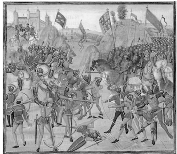
The various Franco-English battles in the Hundred Years' War prompted the Scottish kings to ban unprofitable games like golf to the advantage of practising archery

To prevent the English armies to invade Scotland, it was of paramount importance that the Scots would improve considerably their archery skills.