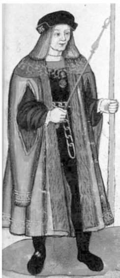
In 1503, King James IV bought equipment to play golf. He seemed to be a keen golfer and not a hockey player.

It is rather interesting to see that the same King James IV bought in Edinburgh in 1503 (Accounts of the Lord High Treasurer for Scotland, February 1503), 12 years after the ban of golf (or hockey?), 'real' golf clubs and balls to play 'match play' with the 2 nd Earl of Bothwell. He did buy already golf equipment in Perth in 1502 and later on in Saint Andrews in 1506. From these purchases, we could conclude that at least with royalty and nobility, golf had become rather popular in the area around the Forth of Fife.