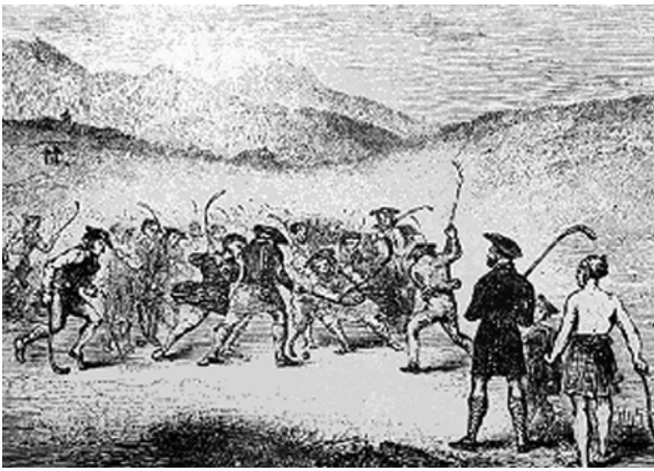
Some historians consider golf as named in 1457 as being a kind of hockey game. Was it perhaps shinty, the centuries old Irish and Scottish 'to and fro' team game? – The Penny Magazine, 1835

... that they never wondered if a game like golf could have evolved out of other more ancient games. This to the contrary of the continent where the early medieval stick and ball games evolved in the course of the centuries into games like colf, crosse, mail and many other more 'modern' stick and ball games.