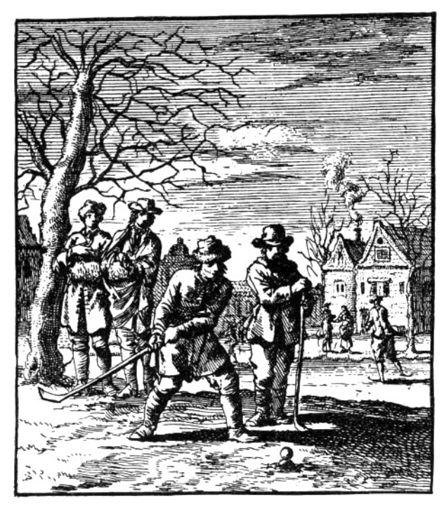
The only picture of Dutch golf showing a ball being driven from a tee. From a copper engraving by Luiken, Amsterdam, 1719

always a few playing a game with clubs similar to our own and in attitudes that leave no doubt that the game has some kinship to our own game of golf.