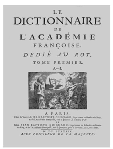
In the first dictionary of the 'Académie Françoise', 1694, the words 'crosser', 'crosse' and 'crosseur' were already included

Because it is unlikely that the Count would use these balls for playing the violent, undisciplined game of hockey, we could conclude that the count probably played a more sophisticated, disciplined golf-like game, in which the ball could easily have been hit 'to an fro', as players in the ancient County of Hainaut in France and Belgium do already since time immemorial in their game 'jeu de crosse'.