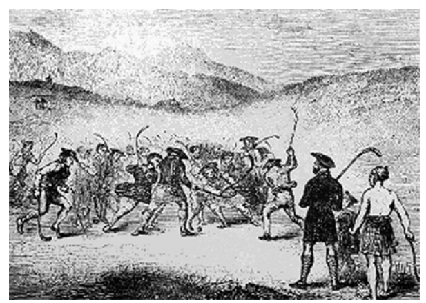
Some historians consider golf as named in 1457 as being a kind of hockey game. Was it perhaps shinty, the centuries old Irish and Scottish 'to and fro' team game?

... that they never wondered if a game like golf could have evolved out of other more ancient games. This to the contrary of the continent where the early medieval stick and ball games evolved in the course of the centuries into games like colf, crosse, mail and many other more 'modern' stick and ball games.