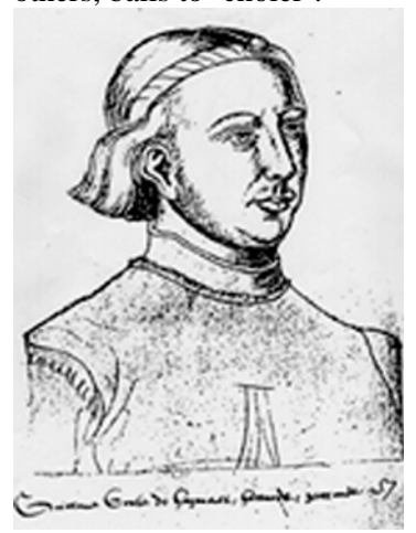
Count William I from Hainaut is the earliest choule/jeu de crosse player known by name. He bought jeu de crosse equipment in 1332. –

The Count of Hainaut bought in 1332, among others, balls to 'chôler'.